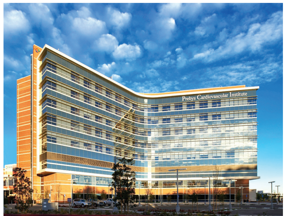
Scripps Memorial Hospital La Jolla

Another recent hospital project of note for McCarthy is the new 383,000-sq-ft Prebys Cardiovascular Institute on the Scripps Memorial Hospital La Jolla campus. This project, which completed early this month, was led by McCarthy as the design-assist general contractor retained by Scripps