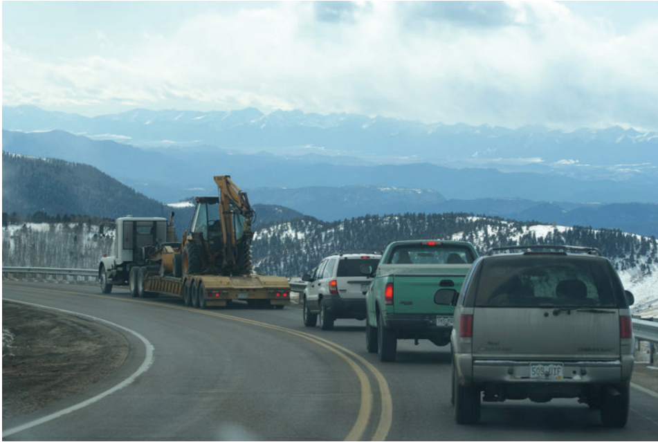
A highway in Colorado, where lawmakers have been sparring over a $3.5 billion bonding proposal to pay for 42 projects.

The victors in down-ballot races could determine what approaches states take toward fixing up rundown roads and infrastructure in the years to come.