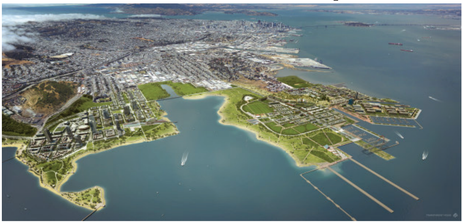
San Francisco Shipyard