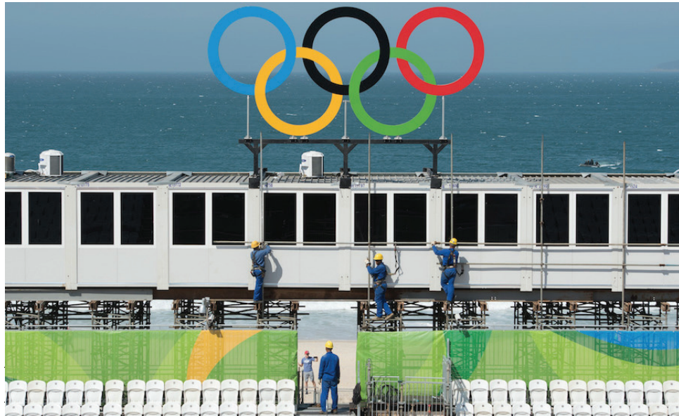
Construction workers install the Olympic Rings in the beach volleyball arena at Copacabana beach prior to the Rio 2016 Olympic Games on August 2 in Rio de Janeiro.

Despite fanfare, Olympic Games are still costly and challenging engineering projects