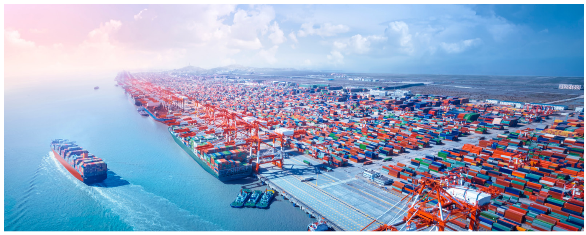
[ Article was originally posted on www.constructconnect.com ]